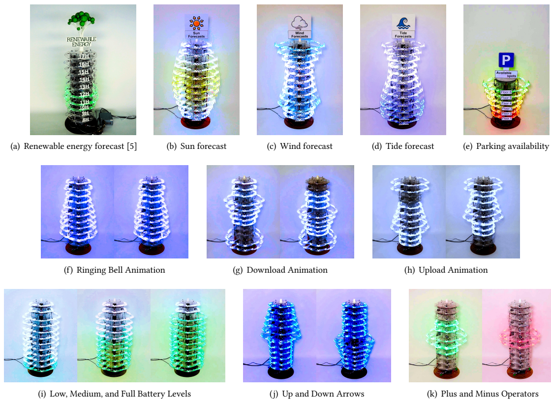
Figure 1: Examples of applications communicating information.