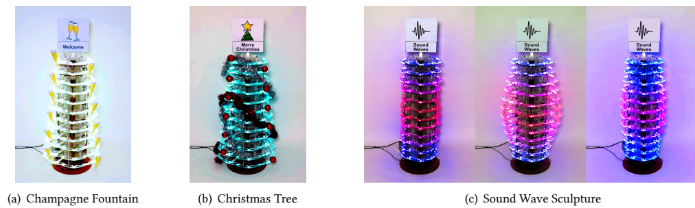
Figure 3: Examples of applications with dynamic sculptures.